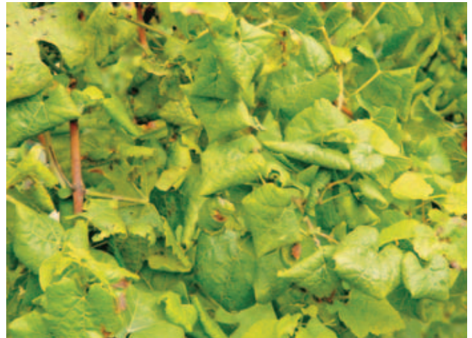
Grapevine leafroll symptoms in white wine-grape varieties (note leaves with margins rolled backwards)