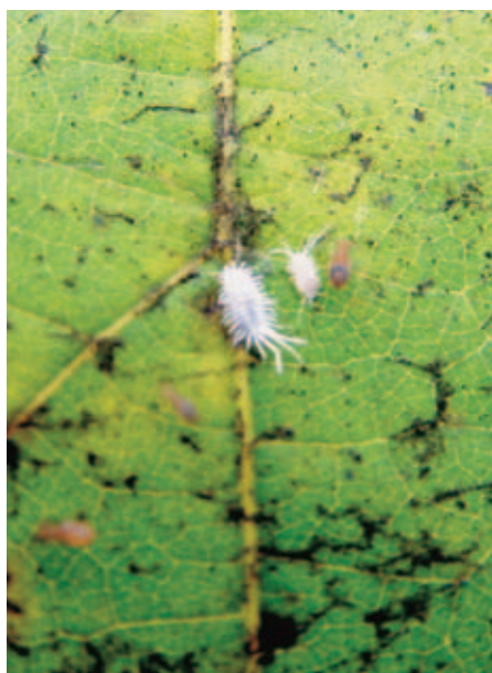
Mealybugs on the underside of grapevine leaves (the best time for monitoring is late in the season and after harvest)

In a related presentation by N.A. Spreeth, ICVG attendees learned about South Africa’s integrated control strategy to prevent the spread of grapevine leafroll disease. Based on a case study at Vergelegen Wine Estate, in Somerset West, the strategy is quite labour intensive and relies on a full suite of chemical controls comprising: