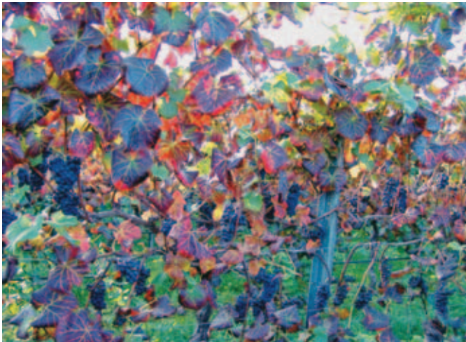
Grapevine leafroll symptoms in red wine-grape varieties (note the early autumn colourations of red between green veins, and leaves with margins rolled backwards)