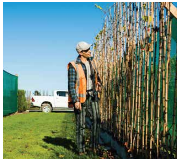
Vines are 1.8m tall, attached to a bamboo stake.