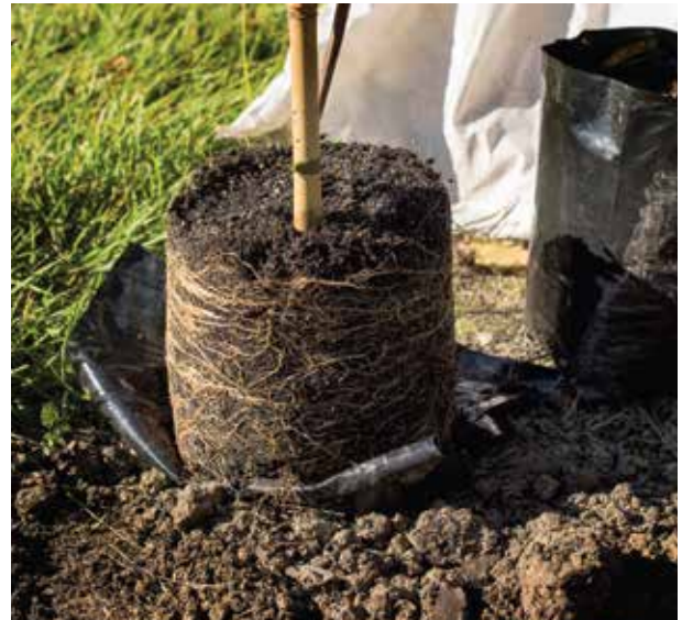
Root mass brimming with fibrous roots.

To provide plant material that is true to type, of high health and known virus status, and produced to exacting physical specifications.