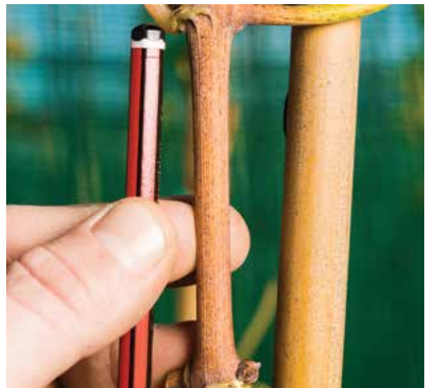
The fully lignified cane is pencil thick (7mm).

VISIT OUR WEBSITE FOR UP TO DATE PLANTING AND POST-CARE INSTRUCTIONS