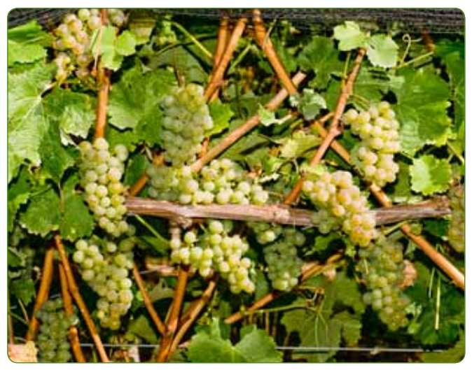
Sauvignon Blanc ENTAV-INRA® Clone 242 at Riversun source block

Sauvignon Blanc FPS 01 (also referred to as UCD Clone 1) was for many years the only registered clone of this variety