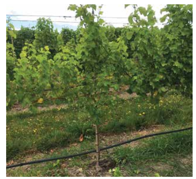
May 2017: Sauvignon Blanc SuperVines planted 2016