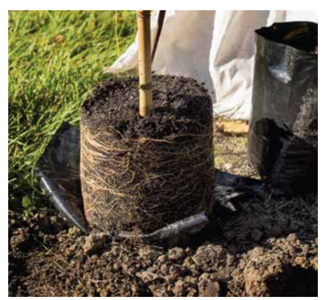
Root mass brimming with fibrous roots.

VISIT OUR WEBSITE FOR UP TO DATE PLANTING AND POST-CARE INSTRUCTIONS 0800 113 747 www.riversun.co.nz